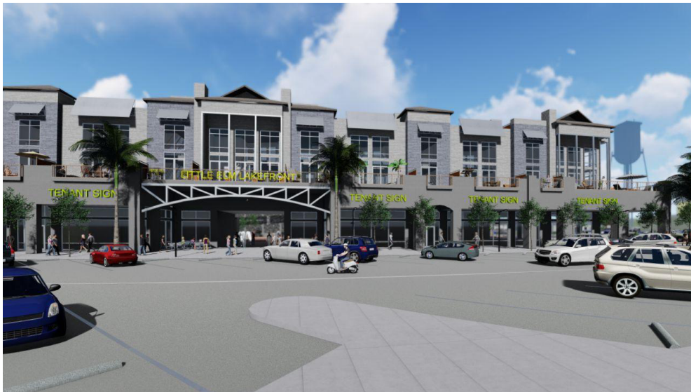
The District at Little Elm will be a four-story project near Main Street and West Eldorado Parkway.

Palladium USA's new rental community will be its second in the Denton County city.