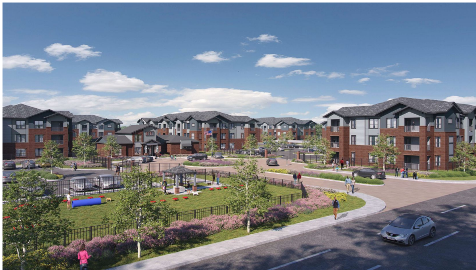
The Palladium Simpson Stuart apartments will have 270 units.

Palladium USA plans new rental project near Interstate 20.