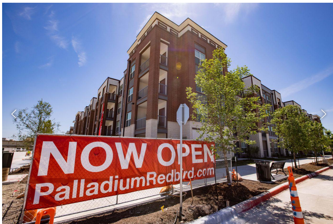
1/6 The exterior of the Palladium RedBird apartments.

"We — the city of Dallas — put $28 million into the project," he said. "If you know the history of this mall and this neighborhood, this was an upscale neighborhood, and now it is coming back."