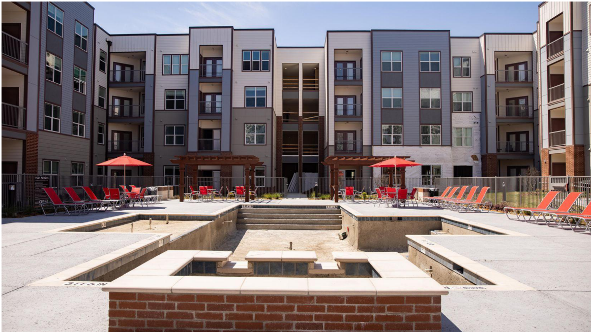
The almost-finished swimming pool area of the Palladium RedBird apartments.

Palladium USA's new rental units are almost fully leased before they are even finished.