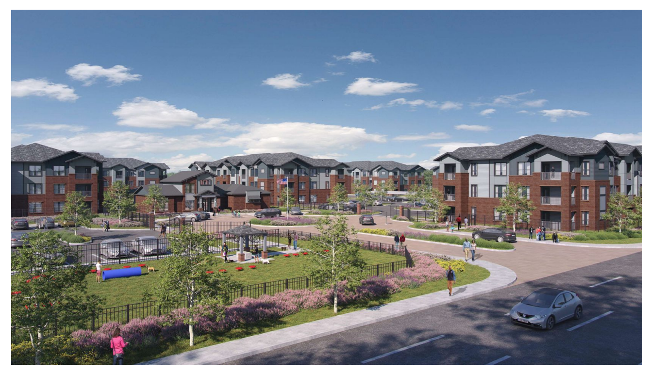
The Palladium Simpson Stuart apartments will have 270 units.

The project near Interstate 20 is the latest for builder Palladium USA.