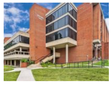
DHCD Provides Construction Financing for 54-Unit Affordable Seniors Housing Project in D.C. April 13, 2021