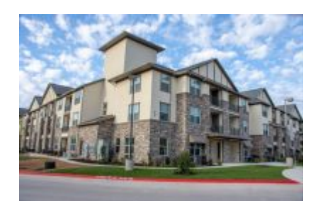
Highridge Costa Opens $21M Affordable Community in Cibolo. Texas July 9, 2019