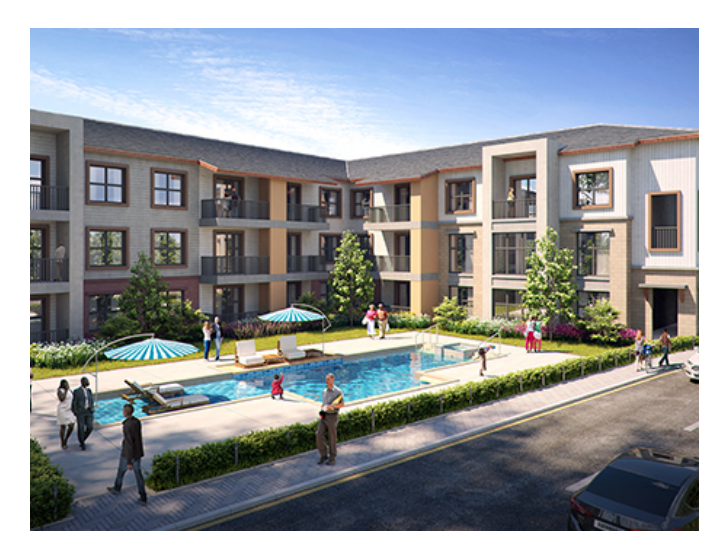
Palladium expects to deliver the first units at its new mixed-use community at 2440 Southwell Road in Dallas in June 2022.