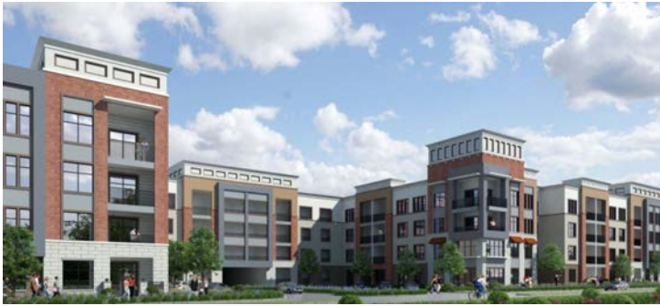
Palladium USA’s new rental community in the Redbird Mall redevelopment will open early next year. (Palladium USA )